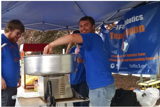
At the MS